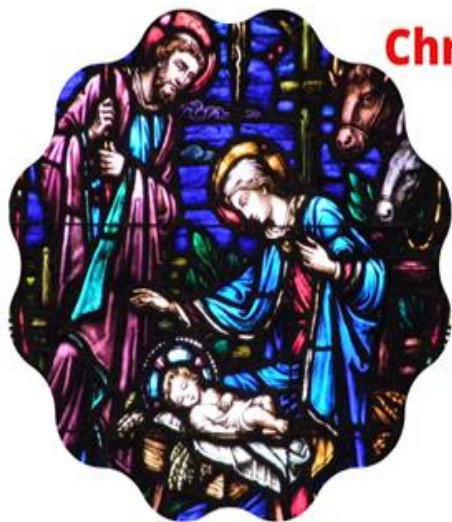
Stained Glass Window, Cathedral of St. Peter Wilmington, Delaware